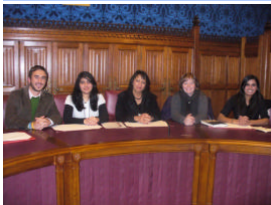
Current scholars on the panel at The House of Lords.

The Fulbright Forum this year began with a tour of Shakespeare's Globe Theatre, Tate Modern, the Museum of London and the Houses of Parliament. On their final evening scholars gathered in the House of Lords for a panel discussion on Fulbright scholar Jim Sciutto's new book,