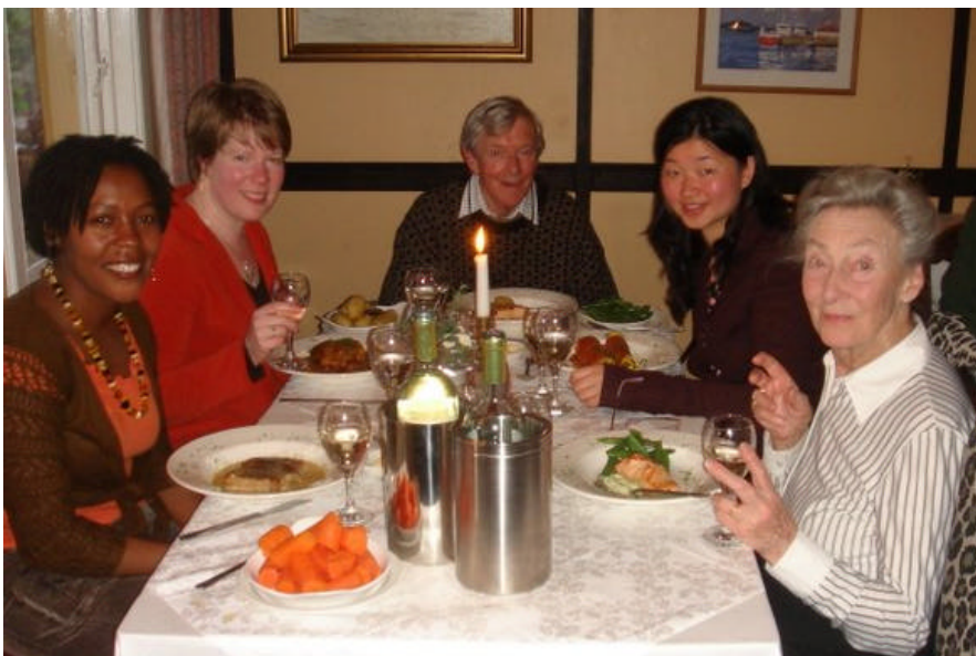
Fulbrighters enjoy dinner at the Argyll Hotel on Iona.