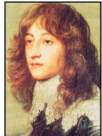
Prince Rupert as a young man