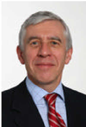
Lord High Chancellor and Secretary of State for Justice, Jack Straw.

The BFSA Autumn reception to welcome back 2008 Fulbright scholars from their award year in the USA will take place in Scotland Yard on 7th October. The BFSA is delighted that this year we have one of the country's most prestigious political leaders as our speaker in an equally impressive venue.